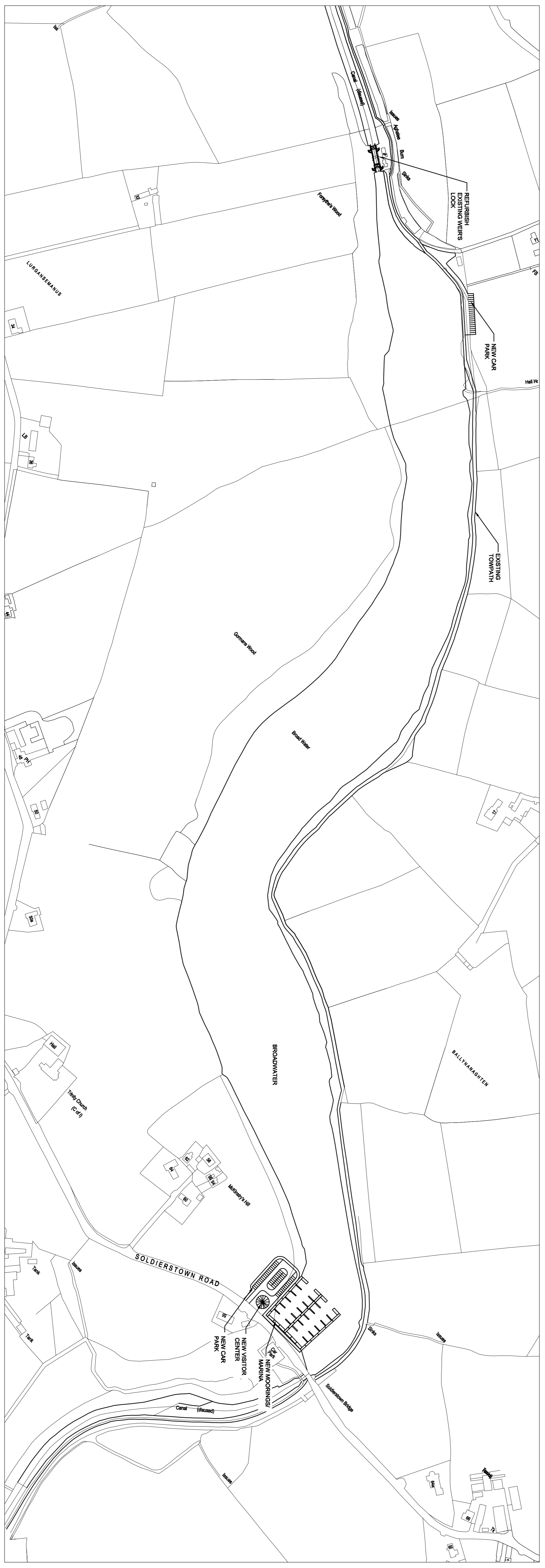
PLAN 17 - BROAD WATER TO AGHALEE BRIDGE SCALE 1:2,500